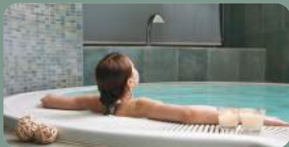
VIP WELLNESS APPOINTMENTS