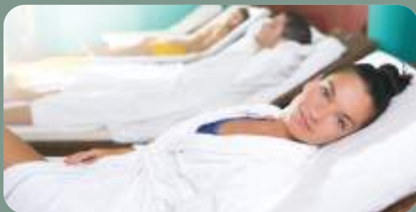
DAILY, WEEKLY, MONTHLY, SEMI-ANNUAL AND ANNUAL SPA TICKETS