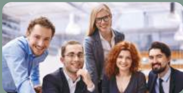
COMPANY SPA TICKETS

Ask at the spa reception for more information about the benefits we provide for our loyal customers.